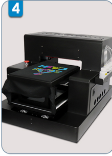
4 Print color