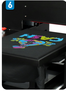
6 Finished clothes