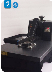
2 Heat press machine 170° degrees 20 seconds