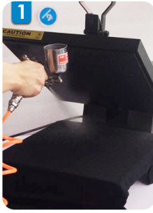
1 In a dark T-shirt print image position evenly sprayed white ink fixing agent