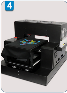
4 Print color