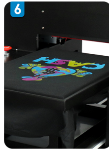
6 Finished clothes