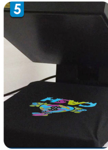
5 Heat press machine 170° degrees 60 seconds