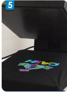
5 Heat press machine 170° degrees 60 seconds