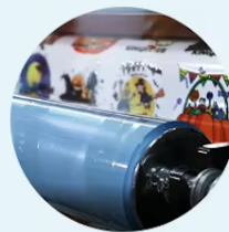
Cover with Film B