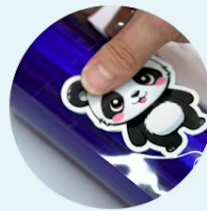
Stick it on the object