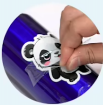
Tear off the Film B