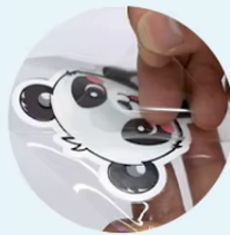
Tear off th Film A